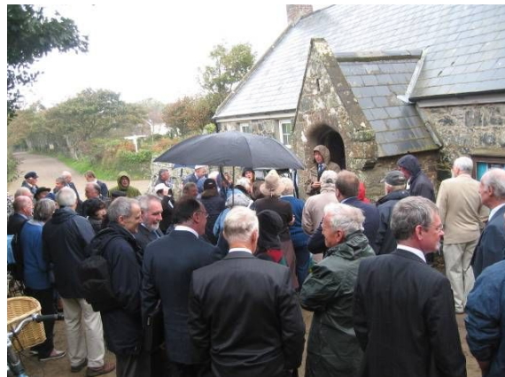
The crowd outside Chief Pleas 1 st October 2008