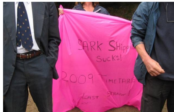
The proposed 2009 timetable has stirred up some strong reactions!

It is time to face the facts and start providing the people of Sark with the service they need, as envisaged by Dr Spencer's report.